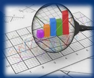
2014-15 Service Request Entry