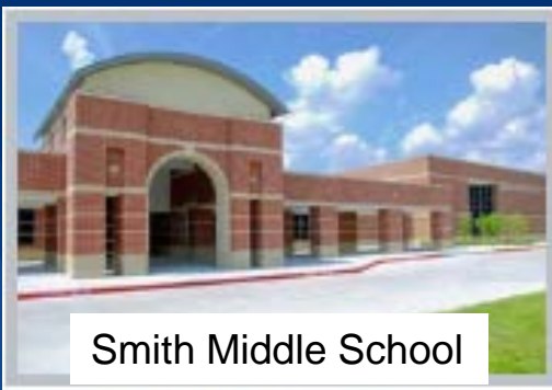
Smith Middle School

Technology Services is very appreciative of all that our Librarians do to bring learning alive for our students.