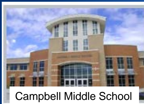
Campbell Middle School