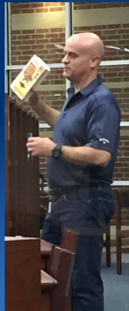
Mr. Thomson Smith Middle School