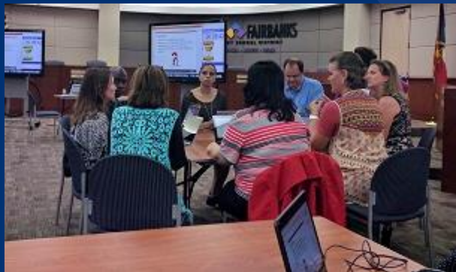
Instructional Technology Advisory Committee