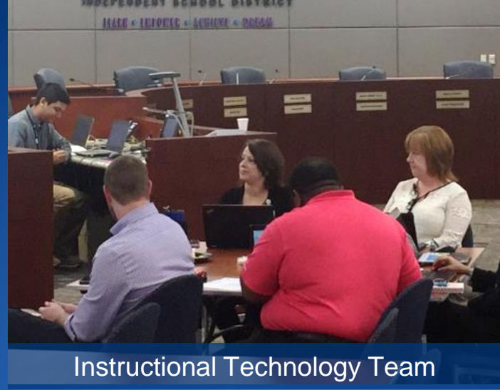
Instructional Technology Team