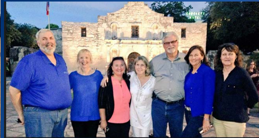
Texas K-12 CTO Council Board Members