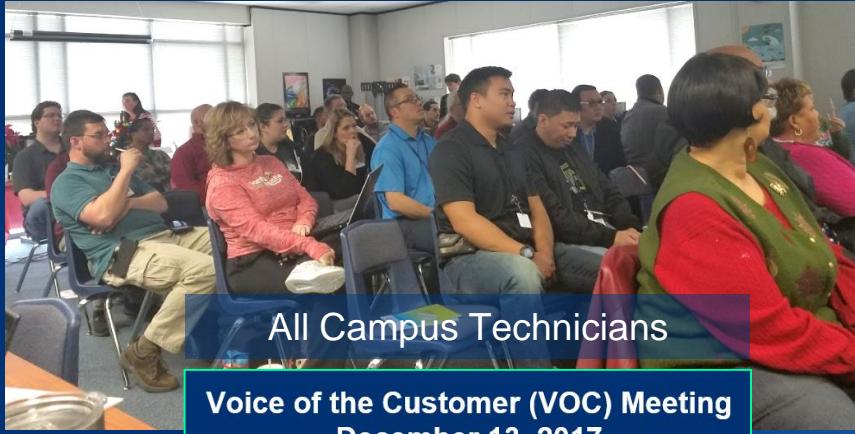
All Campus Technicians