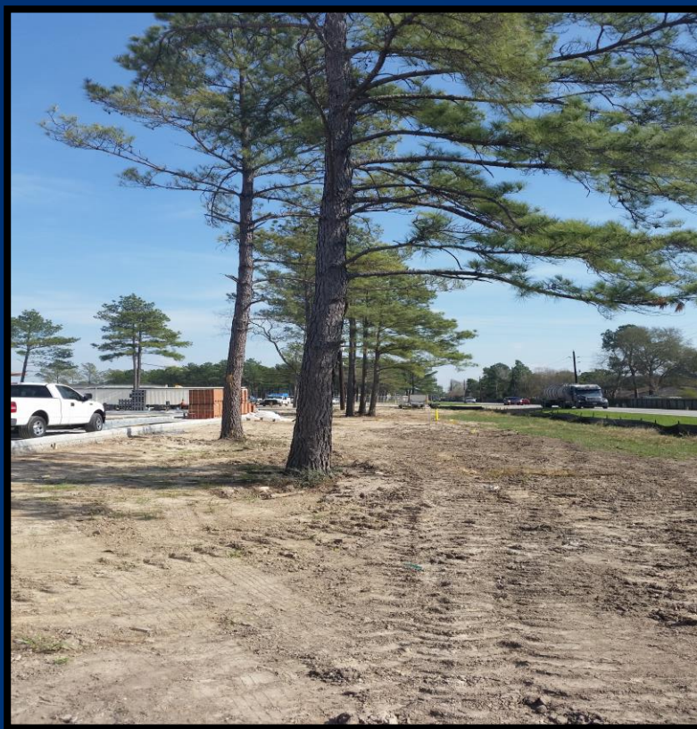
Proposed fiber route from north end of property along Mills Road facing southeast.