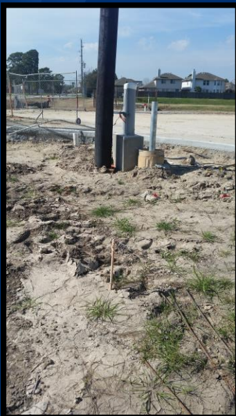
End of the line for the conduit before turning and boring under Mills Road