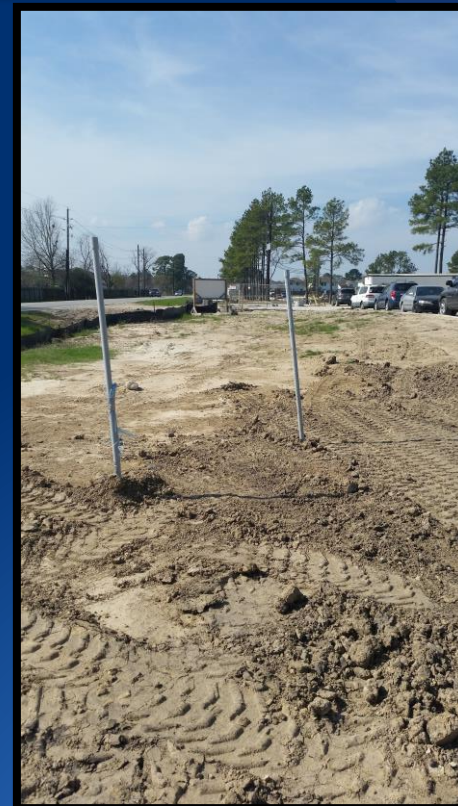
Left pole holds the pull strings to the conduit from the MDF. Right pole is the end of the conduit running 530' along Mills Road.