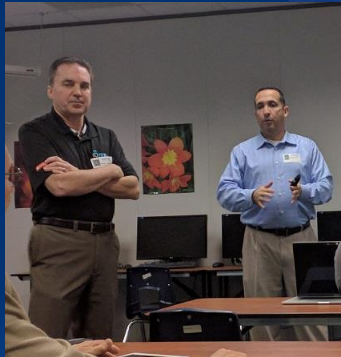
Palo Alto Reps

Palo Alto, along with Layer3, visited DII to show their Traps antivirus solution with Wildfire. Wildfire should trap any virus or malware within 5 minutes of detection, all through the Cloud.