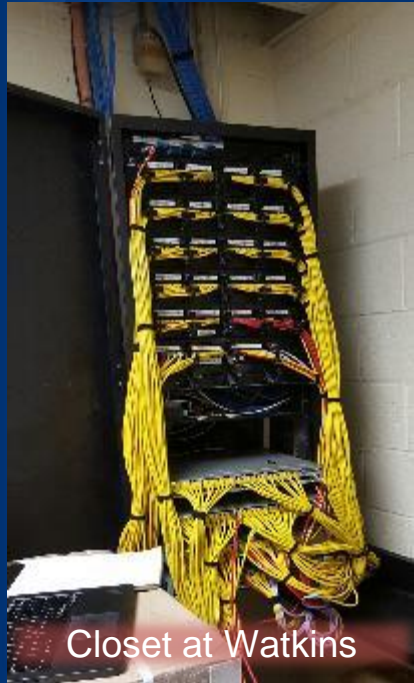
Closet at Watkins