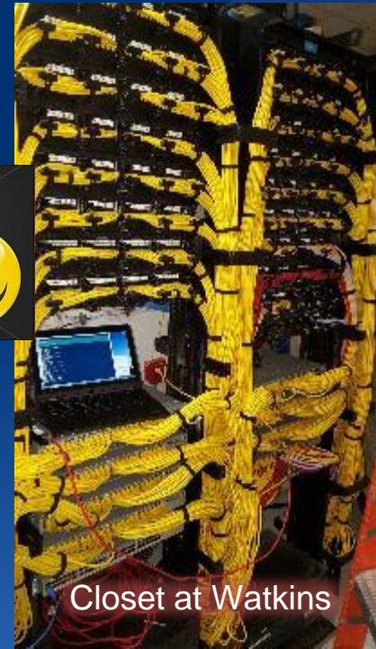
Closet at Watkins