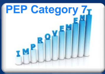
2015-2016 Customer Satisfaction Results