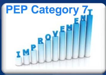
2014/15 and 2015/16 Survey Results Comparison