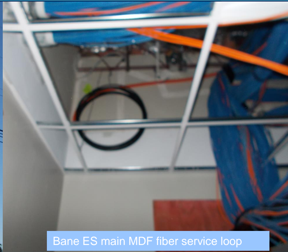
Bane ES main MDF fiber service loop