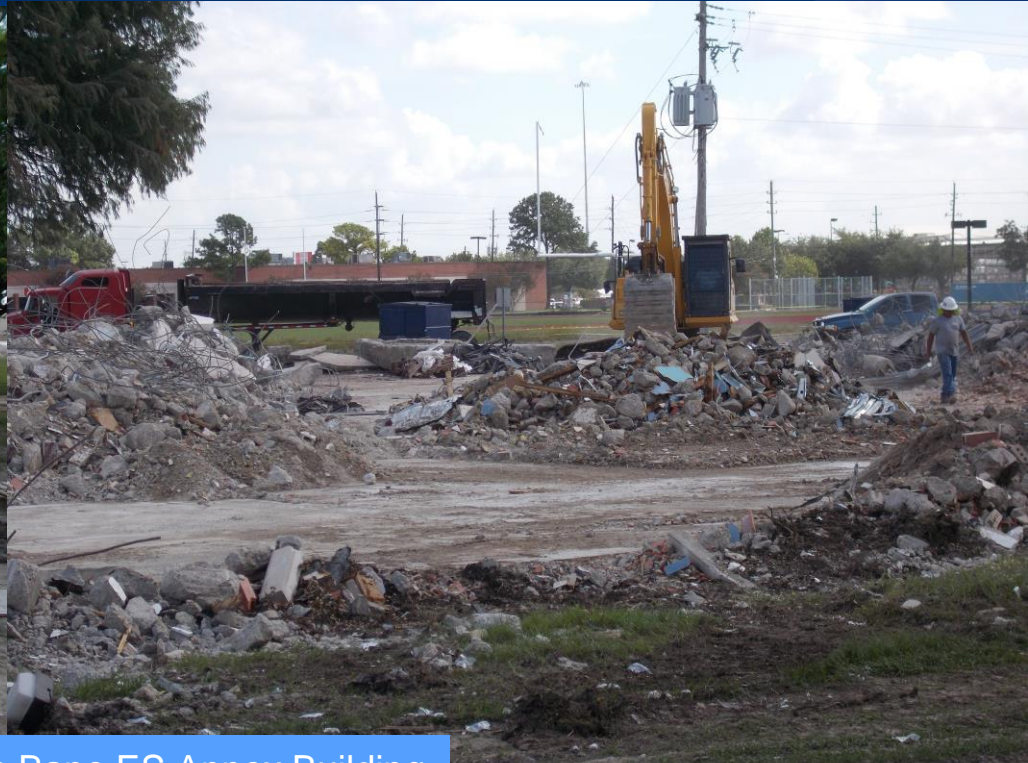
Demolition of the Bane ES Annex Building

Michael Raspet was onsite at Bane ES and drove by what remains of the Bane ES Annex building. This building was built in 1936 and was therefore the oldest building of all CFISD campus buildings. Many of the materials salvaged during the demolition were recycled.