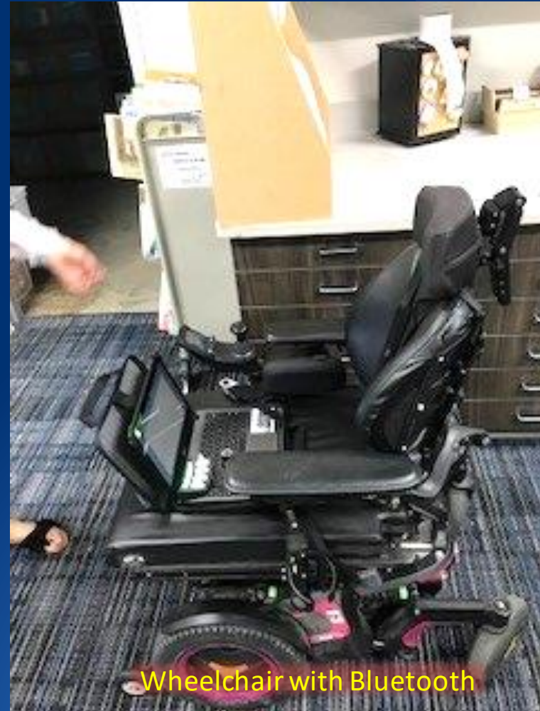
Wheelchair with Bluetooth