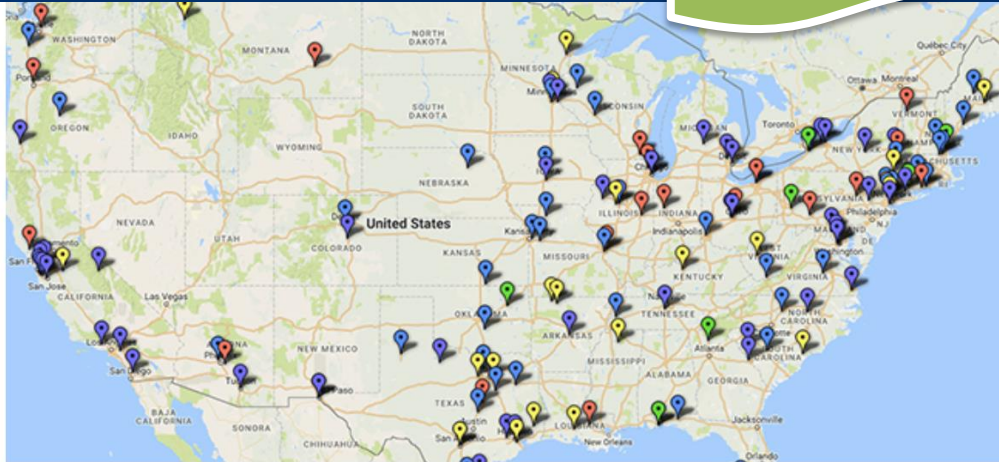
Ed Tech Strategies' K-12 Cyber Incident Map.