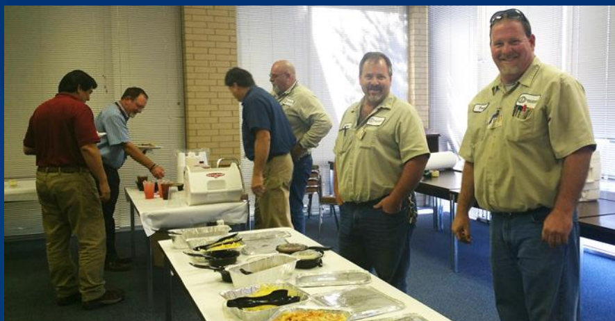
District HVAC Team Serving Staff Catered Lunch