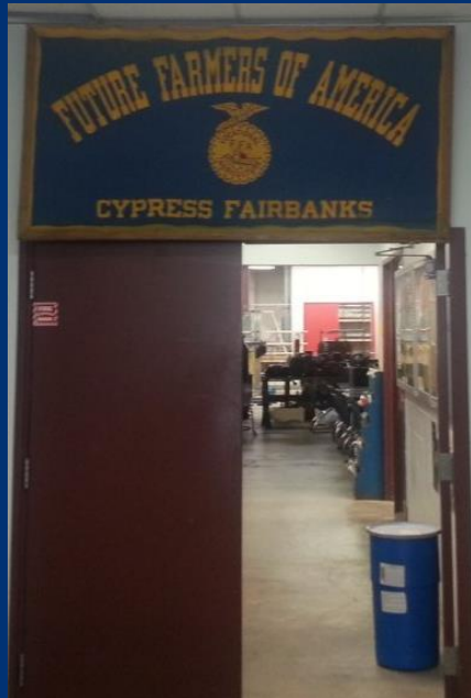
Roland Padilla Verifies Every Student Has Network Access Every Day