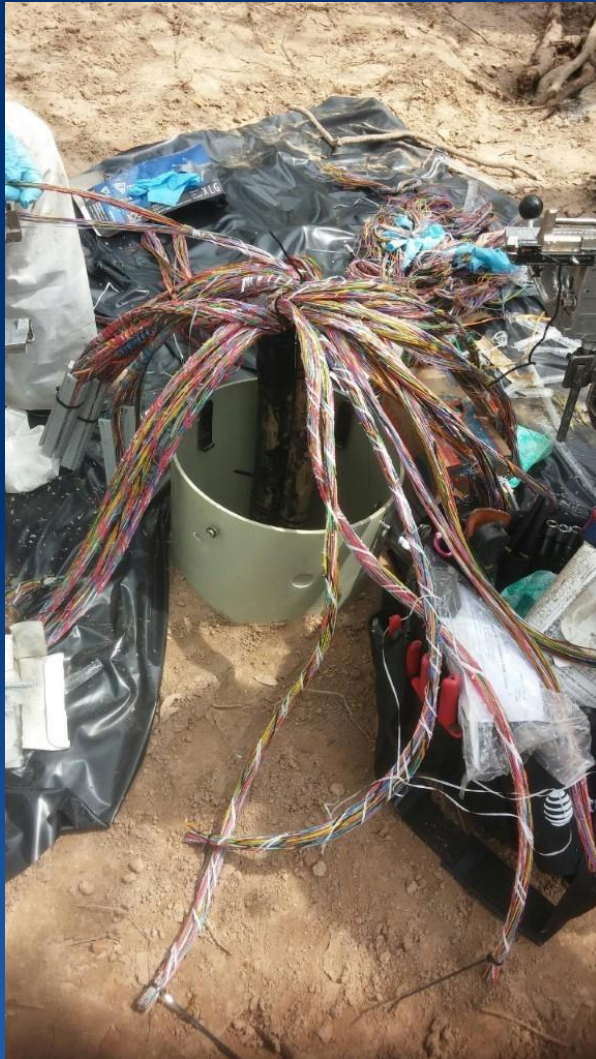
Pictured here are the AT&T technicians splicing and repairing the cables. The technicians ended up replacing 900+ feet of cable in two separate locations.