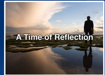
A Time of Reflection

The ISA Leadership Team's Leadership for the week ending January 15 th was conducted on Thursday January 14, 2016. Review the Agenda .