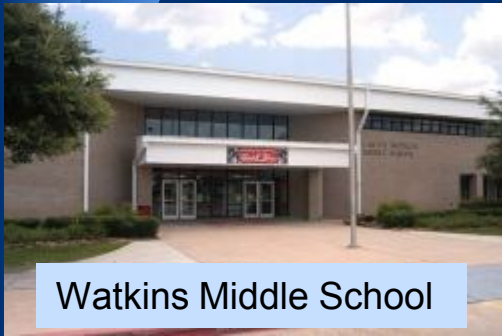
Watkins Middle School